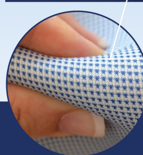
Unique Patent Pending Quadruple layer of fine Polyester Fibres