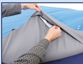
Available with or without a Vapour Permeable Cover.

Using the Unique Patent Pending Quadruple layer of fine Polyester Fibres the Treat-Eezi® naturally and gently moves with the patient creating an almost ZERO chafing area allowing the patient a silent, comfortable sleep along with the assurance any ulcers present are given the best possible chance to breathe and heal.